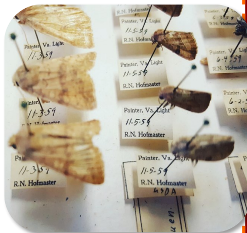
Dr. Dick Hofmaster’s collection of preserved insect specimens at the Eastern Shore AREC

H ow was your pest pressure in 1977? In 2020? Is insect pest presence changing over time on the Eastern Shore? The Entomology Department at the Eastern Shore AREC houses copies of the Vegetable Growers News from 1946-1991, Virginia Truck Experiment Station Bulletins from the early 1900s, 61-year-old preserved insect specimens (imagine the DNA possibilities) and 35 years of black light trap data! Going down the rabbit hole of these historical treasures is, to say the least, interesting for any nerdy entomologist. It certainly is quite fascinating to examine changes in insect populations, particularly when pondering the many reasons behind these fluctuations. Weather, overwintering success, temperature requirements for life cycle, presence of beneficial insects, insecticide resistance, introduction of new insecticides, changes in cropping systems and management are some examples of what causes changes in pressure.