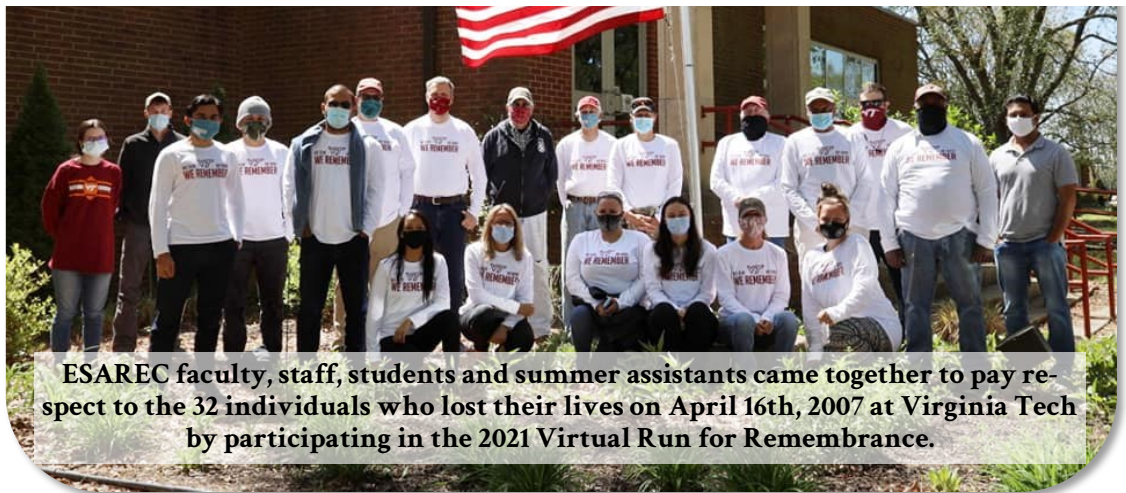
ESAREC faculty, staff, students and summer assistants came together to pay respect to the 32 individuals who lost their lives on April 16th, 2007 at Virginia Tech by participating in the 2021 Virtual Run for Remembrance.