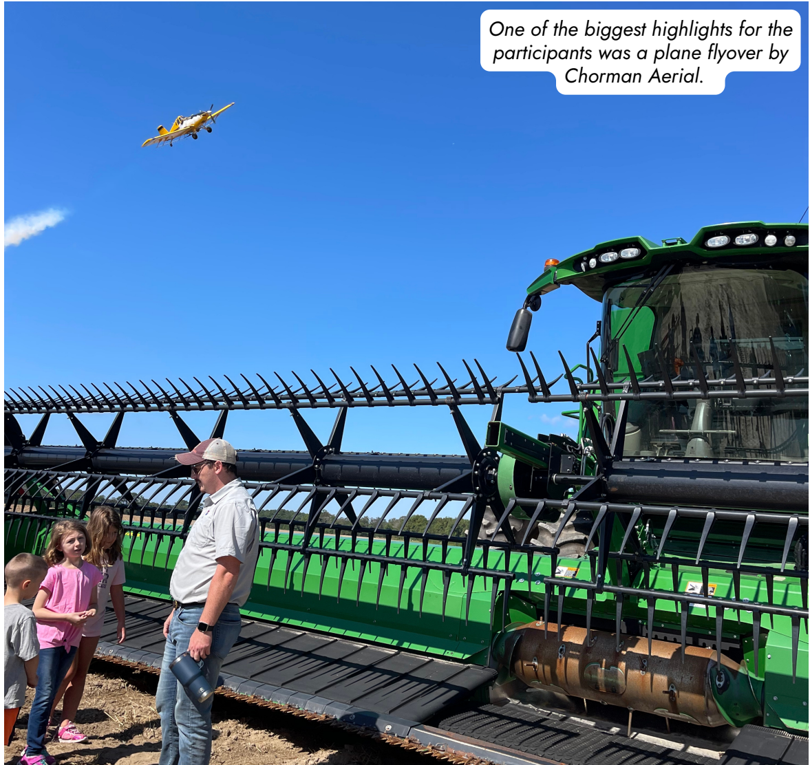
One of the biggest highlights for the participants was a plane flyover by Chorman Aerial.