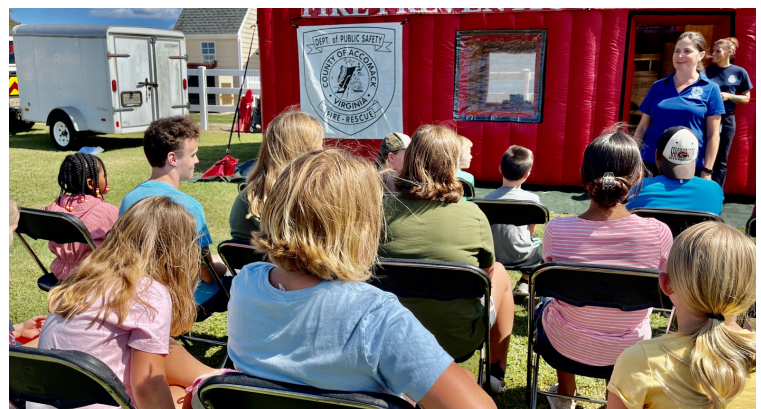
Thanks to Accomack County Emergency Services for their demonstration of fire safety in their smokehouse