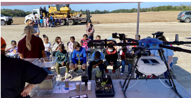
Soil Science grad students from the ESAREC discuss drones and how we use them as a resource in agriculture on the ESVA

Most importantly, a huge thank you to Duncan Farms and the Holland Family for allowing their farm to be taken over during harvest season in order to give these students an true "on-farm" experience.