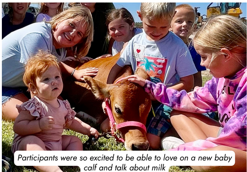
Participants were so excited to be able to love on a new baby calf and talk about milk