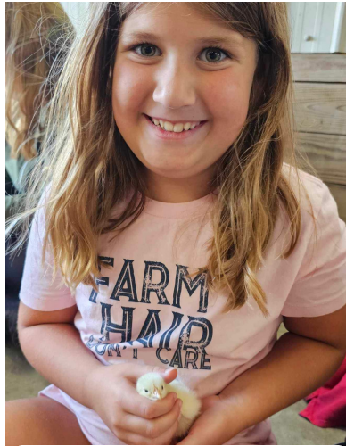
Tyson Food has always the most popular booth with baby chicks for children to hold