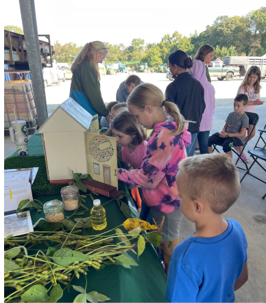
The Soybean Association was on hand to talk soybeans