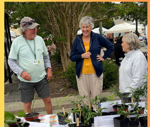
The Exmore Fall Festival was a good opportunity to educate the public on fall planting dates and for members to network