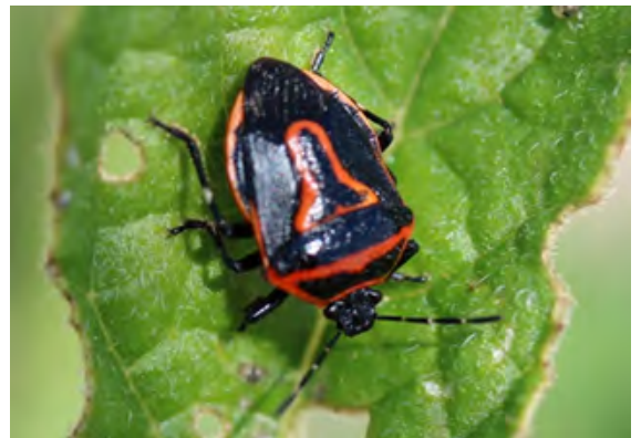
Figure 2. The two-spotted stink bug, a specialized predator of Colorado potato beetles

Beneficial insects: Certain beneficial insects have been observed in larger than usual quantities as well. As with insect pests, beneficials (predators/parasitoids) can suffer from harsh winters. Our past mild winter may have been favorable to lady beetles and predatorial stink bugs as observed in potato and tomato fields on the station. A large amount of Colorado potato beetle egg mass predation by lady beetles was observed.