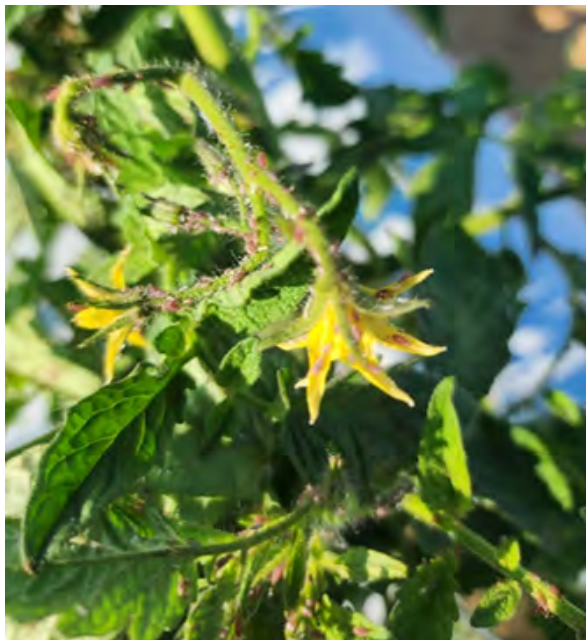
Figure 1. Potato aphids on tomato plant

Thrips: A large number of thrips have been observed in tomatoes the week of June 20th with an average of 145 flower thrips per 20 blossoms.