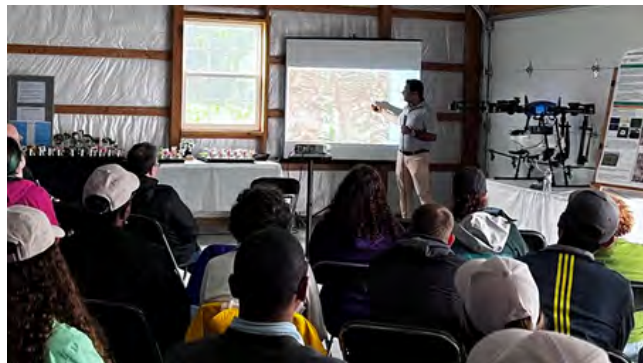
EPA/USDA/IR-4 Educational Agricultural Tour June 21st