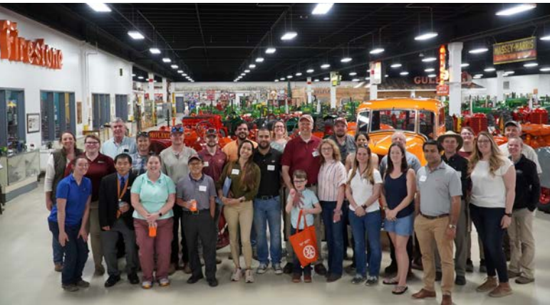
In-service attendees at the Keystone Tractor Museum on April 13th