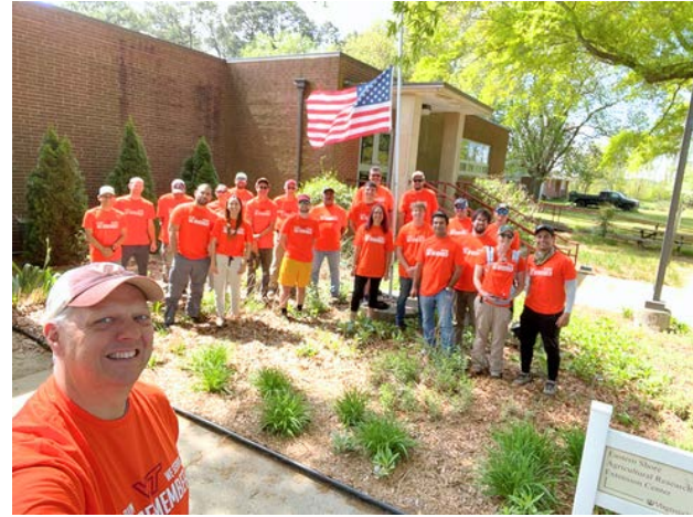
VT Run In Remembrance on April 17th at Eastern Shore AREC