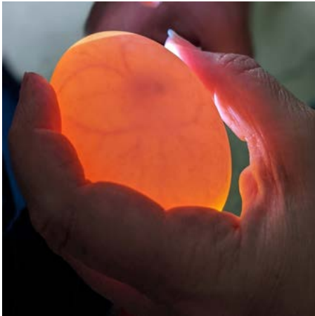
Candling a chicken egg

Embryology is the hatching of chicks in the classroom, providing students with a hands-on learning of life cycles. This project targets second grade as it fits perfectly with Virginia Standard of Learning (SOL) 2.4 and 2.5, the study of life systems.