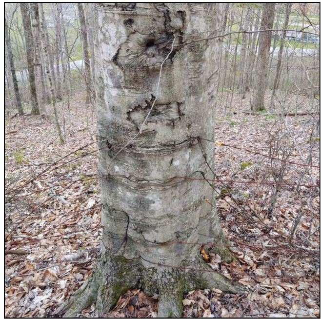
Figure 1. A properly marked corner tree—absent the paint. Notice the three hash marks on the stem.

Boundary lines should be checked regularly and especially after a storm, nearby harvesting, fire, or insect and disease outbreaks. Remark the lines as necessary. Landowners who are not certain where their boundary lines are may need to hire a professional surveyor.