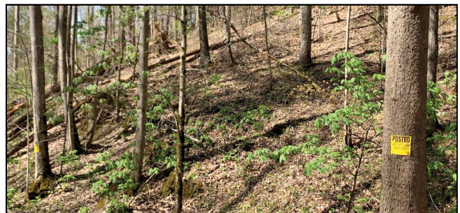
Figure 1. Well-marked boundary lines can help prevent accidental timber trespass. The method shown in this photo is inexpensive and fast, but the boundary will need to be remarked frequently. See Appendix 2 for a longer-lasting method of marking your boundary lines.

To reduce the risk of timber theft, all property boundaries should be properly marked and maintained. (See Appendix 2 on how to properly mark boundary lines.) Well-marked boundary lines protect the landowner, as well as owners of adjoining property. They also help timber buyers and loggers make accurate determinations of acreage and help prevent any accidental trespass (figure 1).