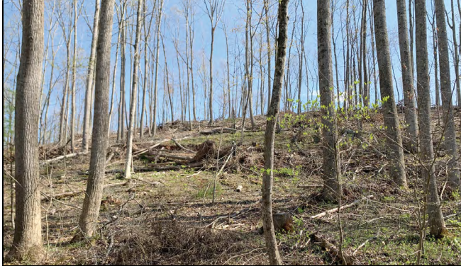
Figure 2. Timber theft in the form of trespass is most likely to occur when an adjacent landowner is having timber harvested.

Additionally, landowners, or their designees, should walk the property regularly (at least once a year if possible) to maintain these boundary markers and check for signs of trespass. The sooner a timber trespass is identified, the easier it is to determine the value of the loss.