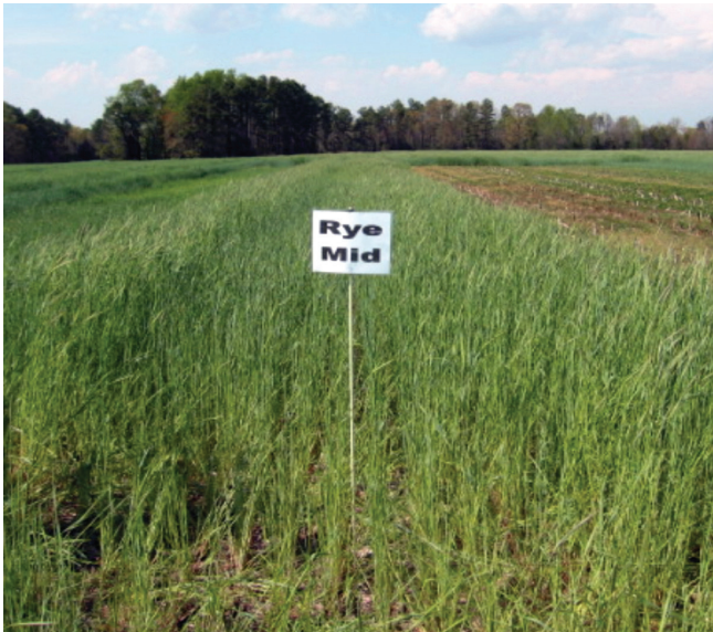
Figure 1. Rye cover crop at the appropriate stage for termination