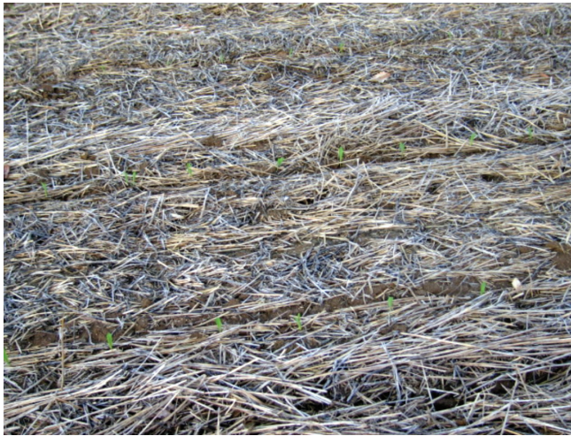
Figure 3. No-tillage corn planting into double-crop soybean residue

The residue present after a soybean crop that was no-tilled into small-grain stubble provides an excellent, water-conserving mulch for planting no-tillage corn.