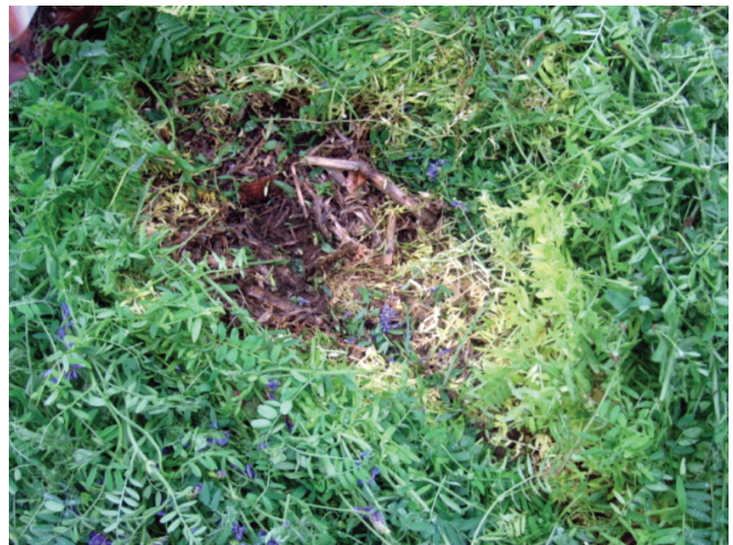
Figure 2. Hairy vetch cover crop

Hairy vetch, Austrian winter peas, and crimson clover are nitrogen-producing winter annuals. These legumes are capable of producing up to 125 pounds of nitrogen per acre if they are planted early in the fall and are killed as late as possible in the spring. Most of the nitrogen supplied by legumes is in the top growth. To obtain 100 pounds of nitrogen per acre, approximately 3,000 pounds of legume dry matter must be produced. In most years, this may not occur until after the normal corn planting date.