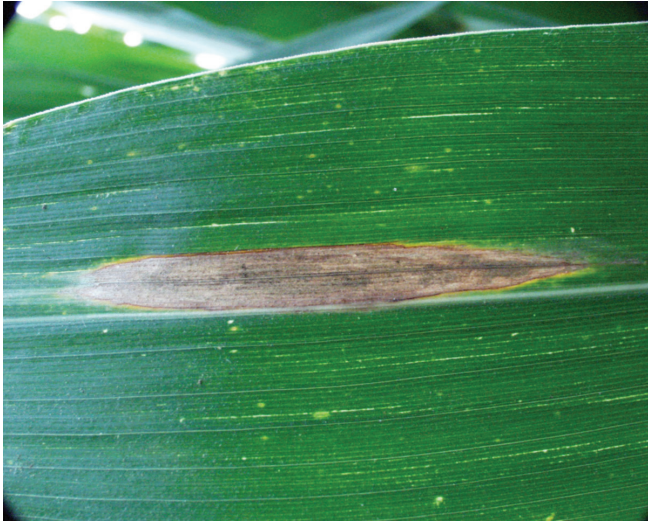
Figure 5. Northern leaf blight on corn

disease is favored by somewhat cooler weather compared to southern leaf blight and has been quite severe in the mountain counties. Under favorable conditions, the disease will spread up the plant. Heavily infected fields look dry and fired, as if they were injured by frost. The best control option for this disease is hybrids with genetic resistance.