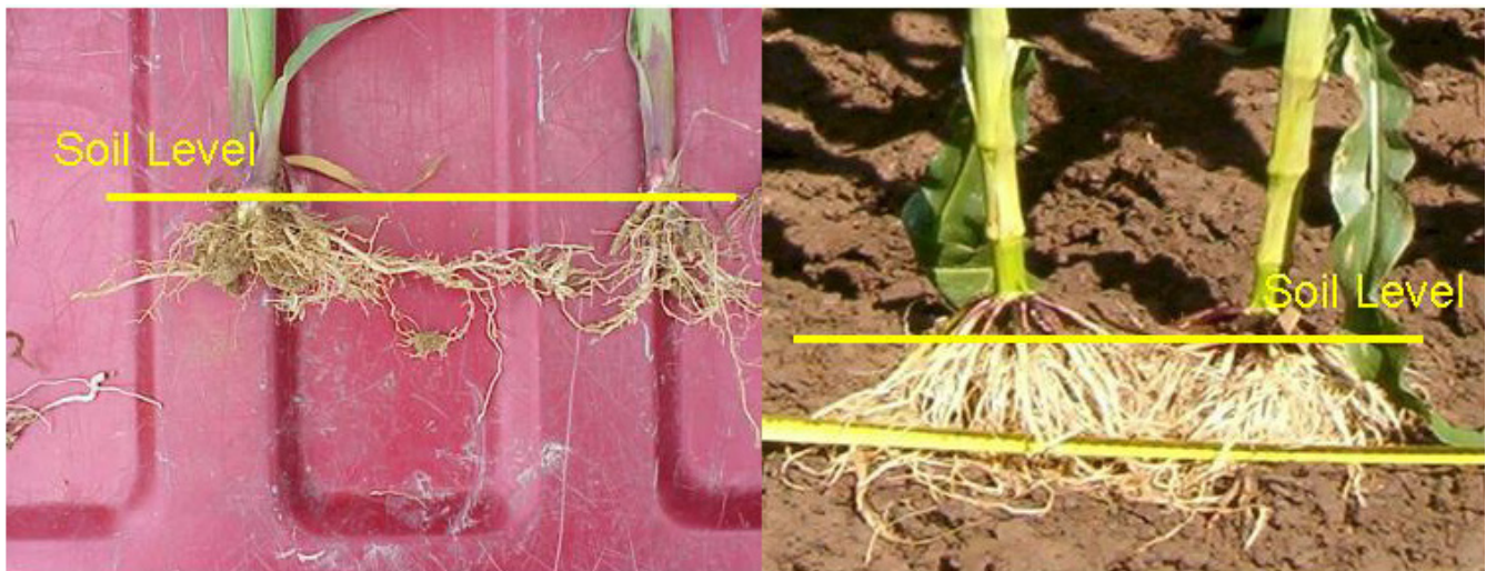
Figure 1. Corn root growth limited by soil compaction (left) and healthy roots from noncompacted soils (right).

about 50 percent of the total soil volume while soil particles make up the other 50 percent. However, this can change dramatically as soil particles are pressed together and the air is squeezed out. Generally, the largest spaces are eliminated first, taking away the path of least resistance for air and water movement as well as for root penetration. Soils with a mixture of textures (some sand, silt, and clay) are more susceptible to compaction than those with homogenous texture, when exposed to the same compactive force.