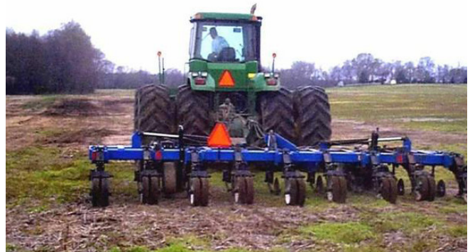
Figure 2. Deep tillage using a no-till ripper. Note the minor soil disturbance and large amount of residue remaining on the soil surface.

by animals when estimating the residue cover required to prevent erosion.