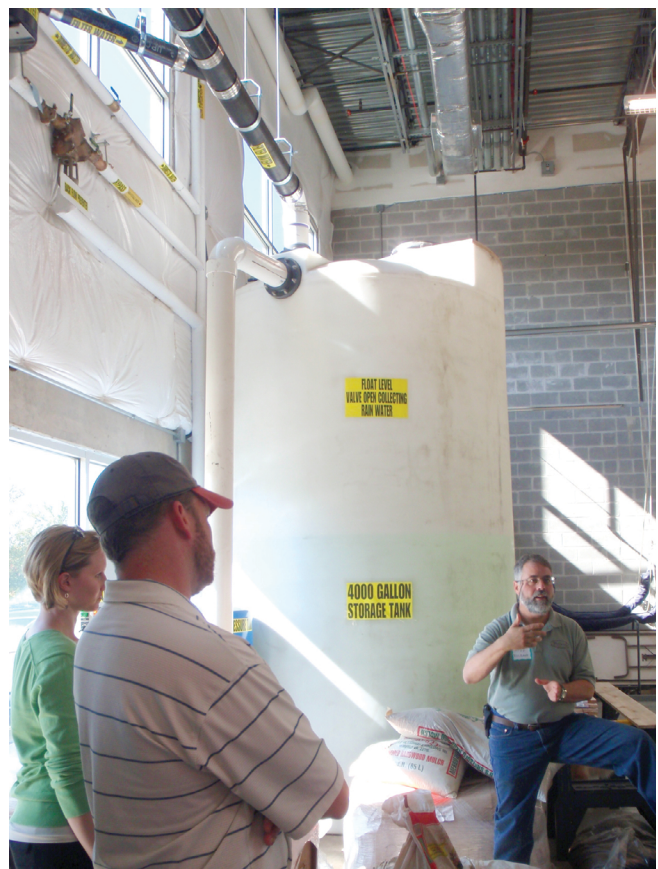
Figure 1. Typical RWH system.

RWH can be used to collect runoff from any impervious area, although roofs are generally the preferred site. Collected runoff can be used for either outdoor or indoor use. Collecting runoff from other impervious surfaces , such as driveways and parking lots, is discouraged due to a much higher level of contamination and pollution. RWH can be used in a variety of urban settings; however, periodic maintenance is required. Underground tanks can be installed, but they have to be adequately supported for the anticipated structural loads placed over them.