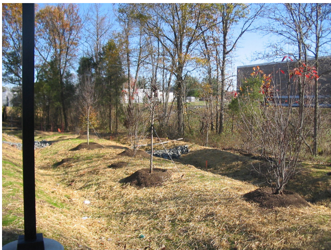
Figure 1. Typical dry swale just after construction.

A dry swale (DS) is a shallow, gently sloping channel with broad, vegetated, side slopes. Water flow is slowed by a series of check dams (see figure 1). A DS provides temporary storage, filtration , and infiltration of stormwater . Dry swales function similarly to bioretention , and are comparable to wet swales ; however, unlike a wet swale, a DS should remain dry during periods of no rainfall. A DS is an engineered best management practice (BMP) that is designed to reduce pollution through runoff reduction and pollutant removal and is part of a site’s stormwater treatment practice (see figure 2).