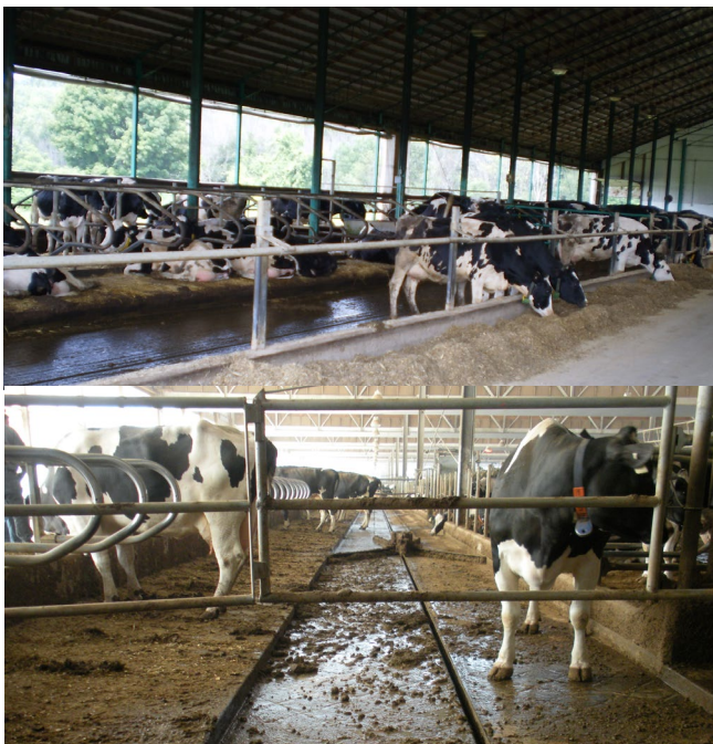
Figure 2. Cows in a freestall dairy barn.

The basic operation principles of compost bedded pack barns are grounded in the general concept of composting where feedstock containing carbon and nitrogen is actively managed to provide the right environment (air and moisture) to encourage microorganisms to breakdown the organic matter. It should be noted that because urine, feces and bedding are continuously added to the bed, the material typically removed from the compost bedded pack barns at cleanout is not completely finished or cured compost product.