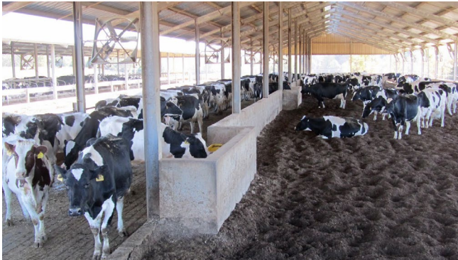
Figure 1. Cows resting on a compact bedded pack dairy barn.

Compost bedded pack barns are an alternative type of dairy housing that provide cows with a large bedded open area for resting (figure 1) rather than individual stalls (figure 2). Typical bedding materials include kiln dried sawdust or wood shavings. Over time, manure is mixed with the bedding on the barn floor. A properly managed compost bedded pack should provide a healthy, comfortable surface for cows to lie on.