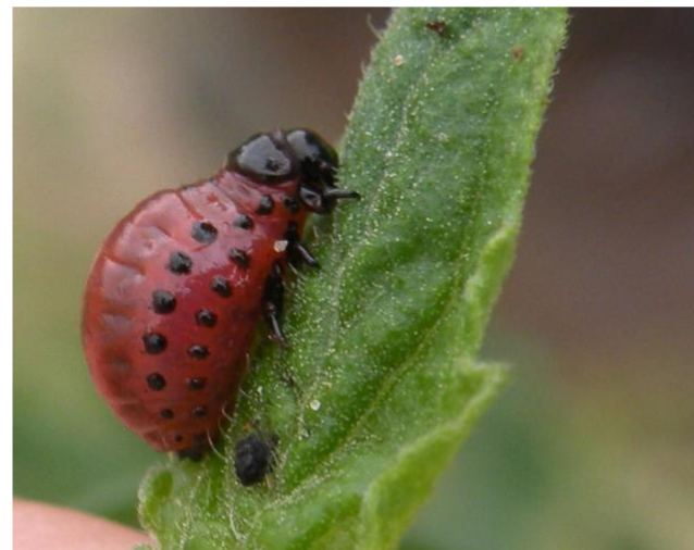
Figure 2. Larval Colorado potato beetle.