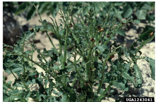
Figure 4. CPB feeding damage to potato.

Adults and larvae feed on foliage in the same manner (Fig. 4). If CPB adults are present early in the season, they will clip small tomato or eggplant transplants or the emerging potato shoots at the ground level. As the larvae grow, they disperse through the plant canopy and consume large portions of the foliage. Large (third and fourth instar) larvae and first-generation adults are the stages that do the most damage. If population pressure is heavy, the larvae and adults will completely defoliate the host plant and then feed on the stems. Loss of foliage weakens the plant and consequently results in reduction of marketable yield (tubers, fruit).