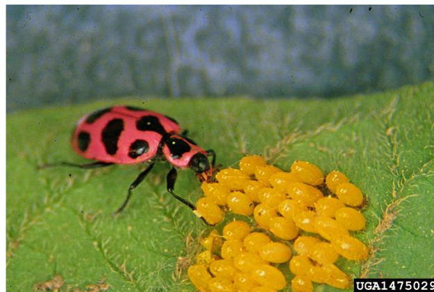
Figure 7. The spotted lady beetle ( Coleomegilla maculata ) eating CPB eggs. Whitney Cranshaw, Colorado State University, Bugwood.org.