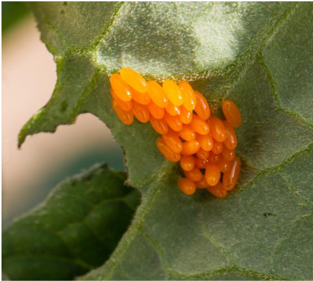
Figure 3. Colorado potato beetle eggs.