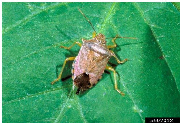
Figure 5. The spined soldier bug ( Podisus maculiventris ) a predator of CPB.

(Fig. 6), prey upon CPB eggs and larvae. Some beetles, specifically the ladybird beetle, Coleomegilla maculata (Fig. 7), and carabid beetles in the genus Lebia also prey on the eggs. Soilborne fungal pathogens such as Beauveria bassiana may cause high mortality of pupae and overwintering adults. None of these organisms, however, are capable of making an economic impact on large populations.