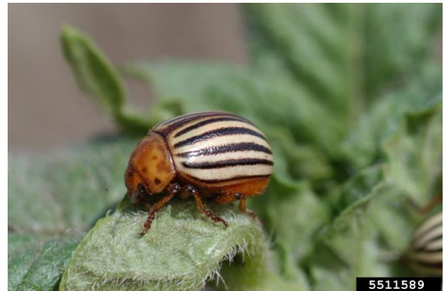
Figure 1. Adult Colorado potato beetle.

humpbacked, and are reddish in color with two rows of black spots along each side (Fig. 2); Large larvae reach a length of ~1/2 inch. Eggs are yellow and deposited in masses resembling small sausages standing on end (Fig. 3).