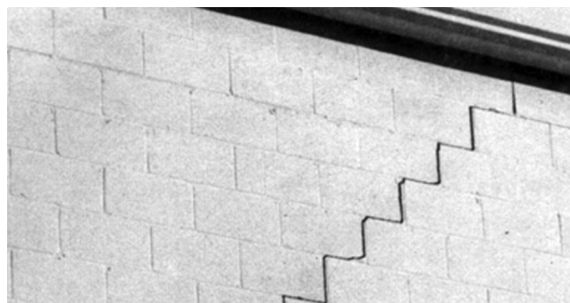
Figure 2. Settlement cracks in a masonry wall that has been subjected to angular distortion due to differential settlement.

appear in plaster and masonry (figure 2), door and window openings become distorted, and ultimately, the integrity of the structure can be threatened. Damaging distortion also occurs as simple lateral strain in which the horizontal distance between a building’s corners changes, generally increasing, leading to the opening of joints and cracks. Lateral strain is also associated with settlement, especially deep-seated settlement, and may comprise a significant part of the total structural distortion.