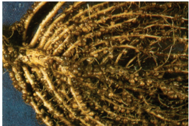
Figure 3. Nodules formed by Rhizobium bacteria on the roots of several legume species. When nodules are present, legumes can “fix” nitrogen from the air, satisfying their own nitrogen nutrition requirements and providing excess nitrogen to nonlegume plant species.

A few of the more important legumes are described in more detail below.