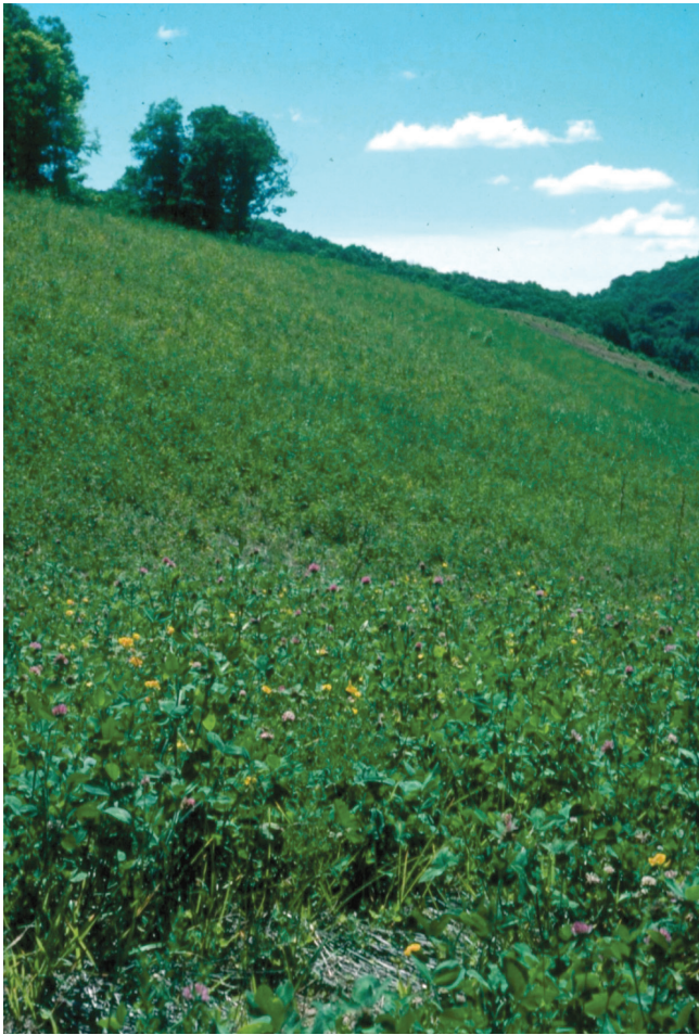
Figure 6. A pasture on a reclaimed mine site in northern West Virginia that was established using several grass and legume species, as described in this publication.