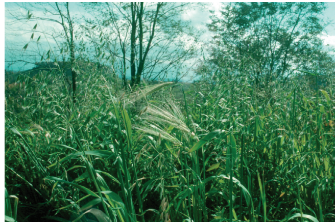
Figure 1. Fast-growing annual grasses, most of which are annuals, are often seeded as “nurse crops” to protect the perennial grasses and legumes that are generally slower to establish. These fast-growing annuals also provide organic matter to the soil as they decompose after dying off.

Fast-growing annual species (such as oats or millet) may be included in reclamation seed mixes as companions to perennial grasses and forbs. These fast-growing annuals are often called “nurse crops” because they provide protection for the perennial species that are