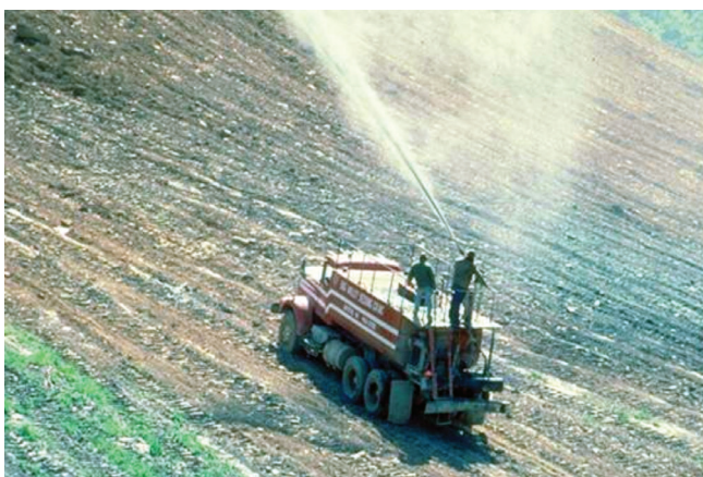
Figure 5. A hydroseeder applying seed in a fertilizer slurry while revegetating a surface coal mine.

In central Appalachia, surface mining generally requires reclamation of steep slopes. The most common technique for seeding and applying amendments is through a hydroseeder (figure 5). Fertilizer, lime, mulch, and seed are normally mixed with water in the hydroseeder tank. Commercial cellulose mulch is typically included in the mix at rates of 1,000-1,500 pounds per acre. This material improves seed germination during dry weather and aids the hydroseeding process by marking seeded areas. Procedures for adding a legume inoculant and assuring survival of that inoculant in the hydroseeded slurry are discussed above. Fertilizer rates are discussed in VCE publication 460-121.