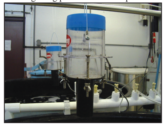
Fig. 8. Automatic dry feed feeder

and/or Artemia are added to the tank in predetermined levels every six hours. When the fry are large enough to begin the transfer to dry diets, a co-feeding period begins for a few days. This involves adding the dry diet to the tank (generally with an automatic feeder; see Figure 8) at a set time period just before the addition of Artemia . After a few days of co-feeding, a weaning process occurs whereby more frequent dry diet feedings occur in conjunction with a gradual elimination of the live feed. The fry are considered weaned once they are feeding solely on dry diets. At this point, they can be considered fingerlings, and the process of fingerling production is complete.