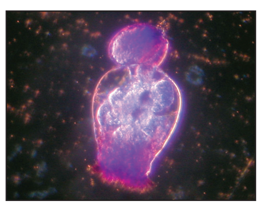
Fig. 4. Stained rotifer with egg

Fry stage – The first live feed which can be raised on a commercial scale and that has demonstrated palatability for the species listed as well as other marine finfish species is the rotifer Brachionus spp. (Figure 4). Rotifers range in size from 200 to about 400 microns (species dependent) and can be raised on algae or commercially available diets. Rotifers are required in large numbers during this feeding stage. A typical feeding rate for rotifers is based upon fry density in the production tank. For example, if cobia fry are stocked at 10 fry per liter at 28°C (82°F), then approximately 10,000 rotifers per liter should be added to the production system every 24 hours (numbers vary considerably based upon exchange and dilution rates for water in the production system). Thus, if 100,000 cobia fry have been stocked, then approximately 500 million rotifers per day will be required.