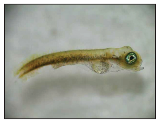
Fig. 3. Cobia sac fry

ing this time, rapid physiological changes occur, such as the development of functioning eyes, mouthparts, and a rudimentary digestive tract. As endogenous reserves are utilized, the fry must begin to consume exogenous reserves or perish.