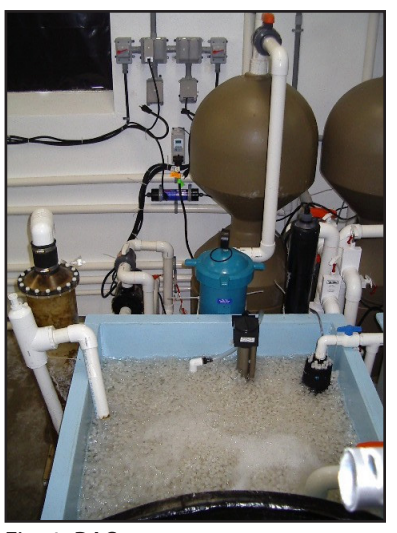
Fig. 1. RAS water treatment

"dirty" water flows out of the production tank, through the RAS for cleaning and sterilization, and returns "clean" to the production tank as needed (Figure 1). The use of RAS technology enhances biosecurity and increases environmental and hydrodynamic control, maximizing production survival and system reliability.