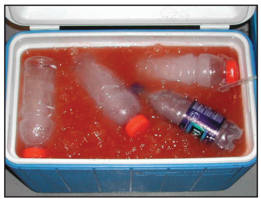
Fig. 7. Live feeds cold storage

Feeding regimens are species- and temperaturedependent. With cobia as an example, algae, rotifers,