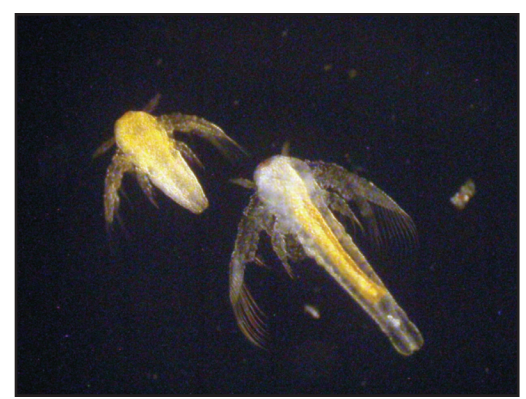
Fig. 6. Artemia

packaged in vacuum-packed containers that have a long shelf life. Artemia are also fed based upon fry density – for the same number and density of cobia fry used in the rotifers example, approximately 250 million Artemia would be needed every 24 hours.