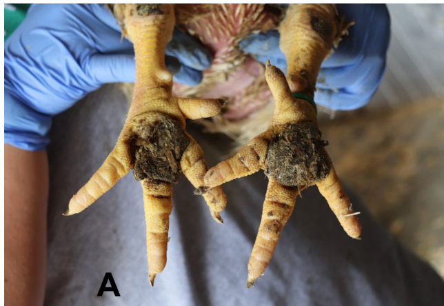
Figure 3. Examples (A and B) of severe footpad lesions in a broiler chicken. Feet may appear dirty, but debris is “attached” to the large lesion. Moderate and severe lesions can be painful.