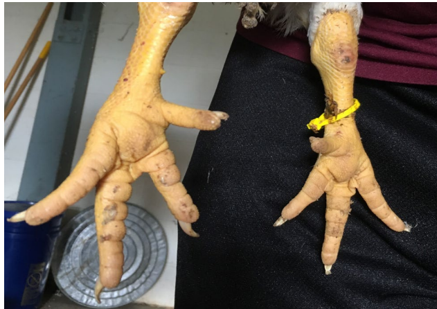
Figure 2. Example of healthy footpads in a broiler chicken.

The major risk factor for footpad dermatitis is the quality of litter or bedding. The key issues are wet litter and associated chemicals present in the wet litter (for instance, ammonia). Litter type and depth also play a role. Other factors — such as body weight, diet, leaky waterers, and ventilation — can indirectly impact prevalence and severity of lesions (fig. 2). For instance, poor ventilation can lead to wet bedding material, and prolonged contact with wet bedding can induce lesion development (fig. 3).