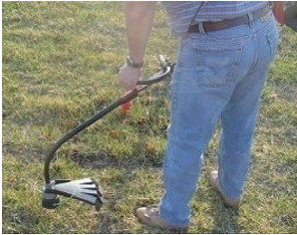
Safe use of a string trimmer.