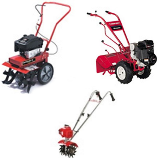
Types of garden tillers.

A garden tiller is a motorized machine that is generally used to loosen and turn the soil with the help of rotating blades. Most garden tillers are powered with small gasoline engines. They are used widely for preparing seedbeds and for cultivation.