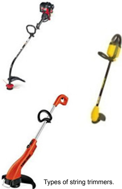
Types of string trimmers.

A string trimmer — also known as a line trimmer, weed whacker, weed whip, or weed eater — is a hand-held device that uses a flexible monofilament line for cutting grass and similar plants around stationary objects. It consists of a cutting head on one end of a long shaft and a handle or handles on the other. Sometimes these trimmers come with a shoulder strap. They are usually powered by either an internal combustion engine or an electric motor.