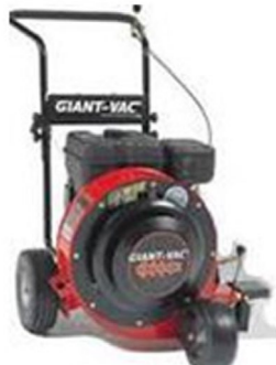
Types of leaf blowers.