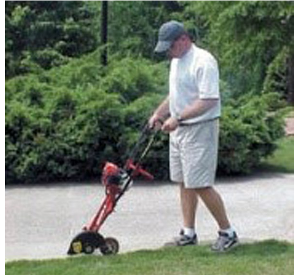
Proper use of a lawn edger.

two-cycle engines and weigh 14 to 25 pounds. Lighter versions (10 to 14 pounds) are now available for non-commercial uses. The larger gas-powered lawn edgers have the capacity to cut a narrow strip between the grass and walkways with the string. Some of these units come with metal bush cutting blades as accessories for cutting small plants. Optional accessories may include blade attachments for other lawn and garden uses.