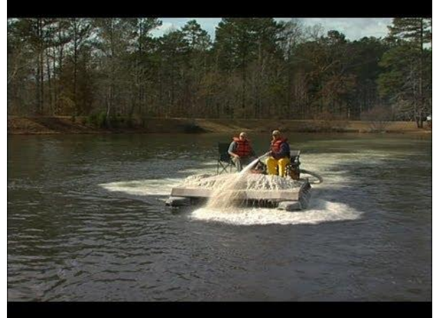
Fig. 3. Using a small boat to distribute lime in a pond.

Make sure that you spread it as evenly as possible.