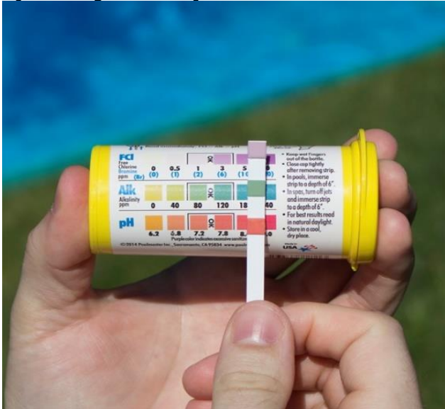
Fig. 4. Simple Test Kit example using strips.

A pond owner should check the water quality of their ponds at least twice a year, once in the spring and again in the fall. At a minimum, it would be a good idea to measure the pH, alkalinity and hardness at least once a year. There are water quality strips that can be used for testing; these strips cost approximately $12-15 for a pack of 50-100. These types of testing strips are found at a SPA, swimming pool and aquarium/pet brick and mortar stores or on-line. (See fig. 4)