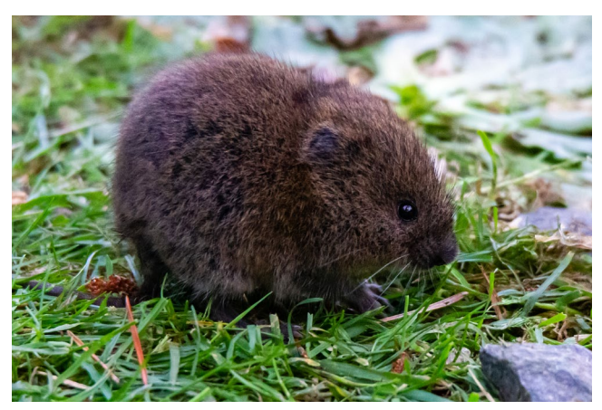
Figure 1. Image of meadow vole ( Microtus pennsylvanicus ).

passageways without much resistance, especially when escaping from predators. Meadow voles usually are a dull grayish-brown to dark brown color with faint yellow tinges on the upper body and a dull gray or dusky silver underside. The meadow vole is larger than most other voles, attaining an adult body length of 120-196 mm (4.7-7.7 inches), with an average length of 6.0 inches and a weight of 20-68 grams (0.7-2.4 ounces); males are slightly larger and heavier than females. The tail of a meadow vole averages about twice the length of the animal's hind foot, typically ranging from 32-68 mm (1.2-2.4 inches) long.