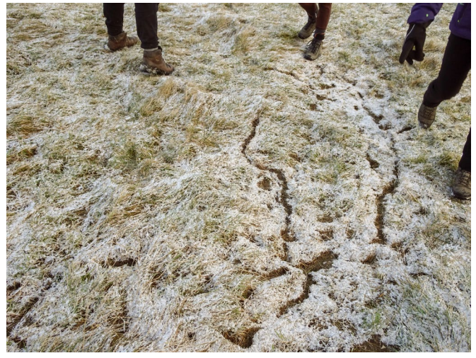
Figure 7. Vole runways through a grass-covered field.