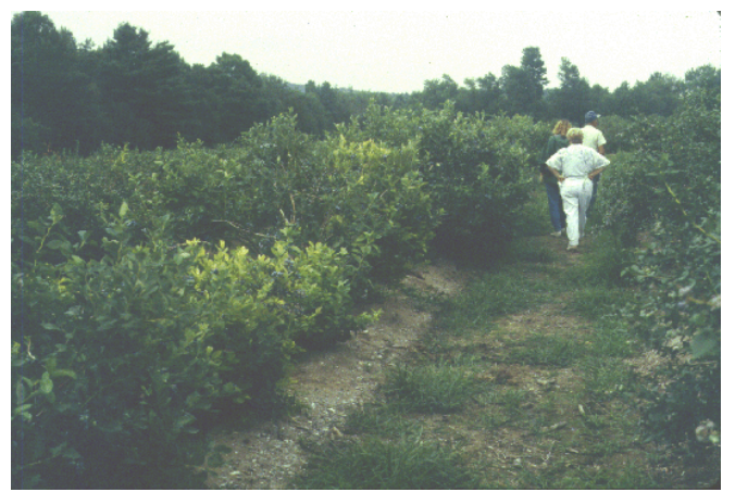
Figure 10. Commercial blueberry plants displaying stunted growth, chlorotic (yellowing) leaves, and visible dead stems due to voles feeding on the underground root systems.

Although the symptoms described above are useful to identify presence, they offer little in terms of defining population status or size. The physical evidence left behind from prior vole activity will persist for a period of time after a colony has collapsed or voles have moved to a different area. Therefore, before beginning to implement any management actions, it's important to establish if and where voles are active and whether the population is increasing or in decline. Failure to do so can lead to wasted time, effort, and money spent on materials trying to address a problem that either no longer exists or isn't bad enough to warrant the outlay.