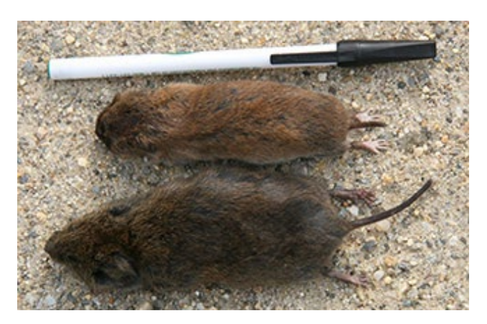
Figure 6. Comparison of the physical appearance and size between meadow vole (bottom) vs. woodland vole (top).

Woodland voles are noticeably smaller than meadow voles (fig. 6), displaying an adult body length of 81-131 mm (3.3-5.1 inches) and a tail length equal to or just shorter than the length of its hind foot (12-30 mm, or 0.75-1.0 inch). Although fur color is highly variable among individuals, adult woodland voles commonly display two color patterns during the year: the summer coat typically is a shiny reddish or chestnut-brown color with black undertones on the upper body and a bland gray beneath, whereas the winter coat is noticeably less vibrant and darker overall. Some researchers describe the woodland vole's tail as being bi-colored, but this condition is not easily detected by most casual observers. The woodland vole has short, smooth, velvet-like fur, nondescript ears, a blunt snout, and readily evident digging claws on its front feet, all physical attributes that facilitate the animal's life and movements underground. The average weight for an adult woodland vole is 17-35 grams (0.6-1.2 ounces.).