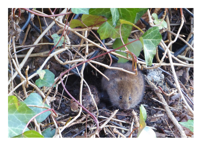
Figure 5. A woodland vole concealed under thick cover.

This rodent (fig. 5) is well-known to producers of tree fruits and nursery stock, as it has a long history for causing problems for these commodities. In Virginia, three subspecies of the woodland vole are recognized: Microtus pinetorum carbonarius , which occurs primarily in extreme southwestern Virginia; Microtus pinetorum pinetorum , which occupies habitats mostly in south-central Virginia; and Microtus pinetorum scalopsoides , the most wide-spread subspecies, which occurs throughout Virginia except in the extreme south-central Piedmont and the far southwestern counties.