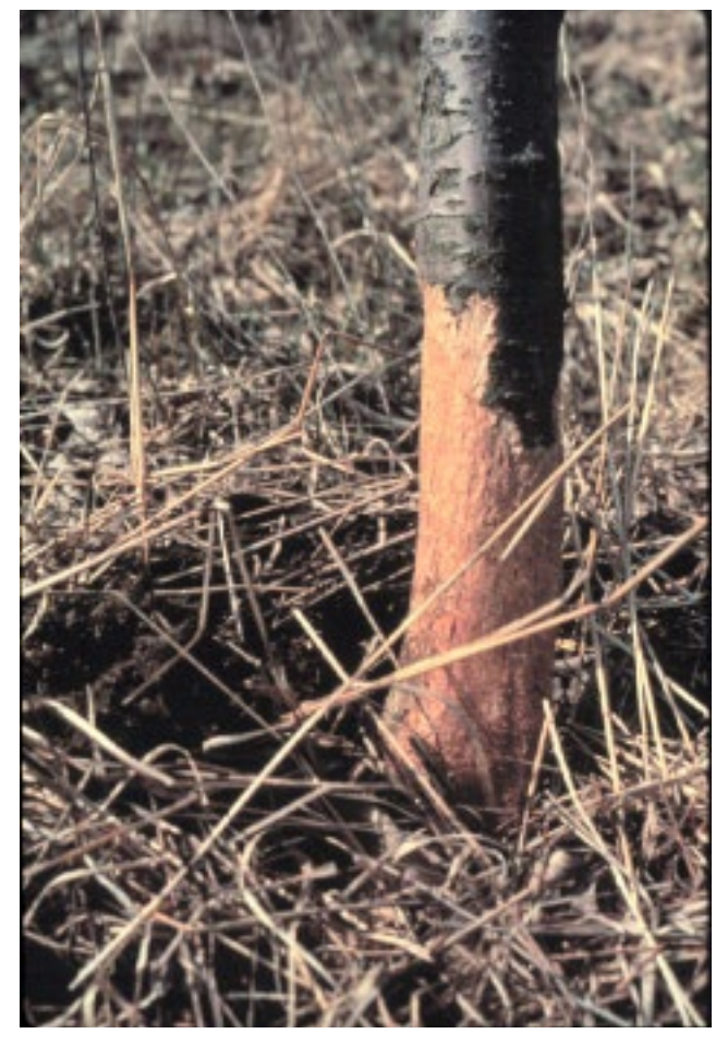
Figure 9. Example of vole girdling damage to an apple sapling.