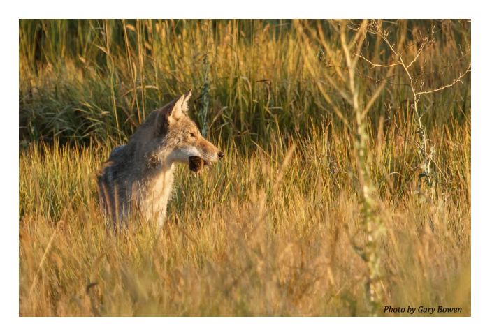
Figure 4. A coyote feeding on a captured vole. ("Coyote Eating a Vole Near Metzger Farm Open Space, Colorado" by Gary Bowen, licensed under CC BY-NC 2.0.) <u>https://creativecommons.org/licenses/by-nc/2.0/</u>

Predation plays a major role in vole populations. In fact, the extant literature suggests that meadow voles may be the most heavily preyed upon small mammal species in North America. A large, diverse group of small and mid-sized predators, including hawks and owls, foxes, coyotes, bobcats, weasels, raccoons, domestic and feral cats, and snakes, preys on voles whenever available (fig. 4). However, given the cyclic nature of meadow vole abundance, predators adaptively adjust their foraging to rely on other prey species during periods of lower vole numbers.