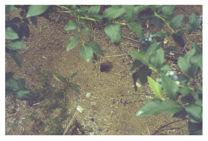
Figure 8. Example from within blueberry plantings of the type of hole created by meadow voles, which provides access to their underground tunnel system.