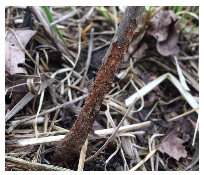
Figure 3. Characteristic example of girdling damage inflicted on a young sapling resulting from foraging activity of meadow voles. ("Rodent damage on planted tree seedlings near Stillwater, MN" by Eli Sagor, CC BY-NC 2.0.) <u>https://</u> creativecommons.org/licenses/by-nc/2.0/

Meadow voles typically are not social animals. During the birthing and brood-rearing period, females become territorial, especially near the nest chamber, and will vigorously fend off intruding voles. Globe-shaped grass nests, about 3-5 inches in diameter, are built in a