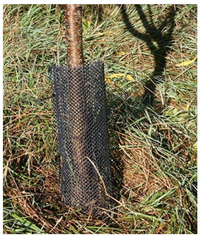
Figure 12. A vole tree guard constructed of ½-inch mesh hardware cloth.

Orchardists historically installed wire mesh or plastic barriers around the base of every tree in a block. These tree guards, constructed of hardware cloth, wire mesh fencing, or heavy plastic, extend about 18 inches up the trunk (higher in areas of deep snow) and at least 1-2 inches below the soil line (fig. 12). Although these devices may provide some protection against meadow voles and perhaps rabbits or woodchucks, they do not prevent the damage caused by woodland voles that forage on the underground root system. Use of physical barriers to deter vole damage on a typical reforestation project quickly becomes expensive and rarely is practical.