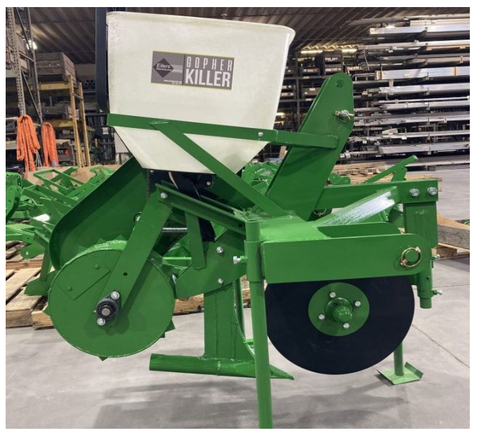
Figure 14. A tractor-mounted mechanical burrow builder.