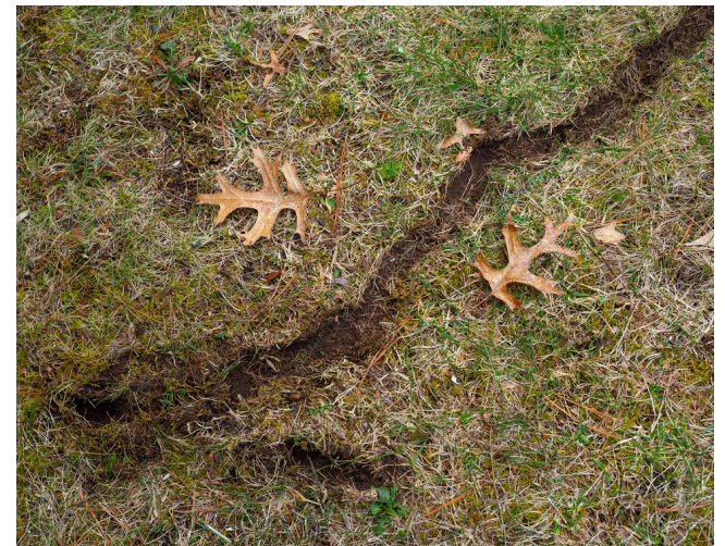
Figure 2. Example of the snake-like surface trails meadow voles create under vegetative cover.

beneath thick, matted vegetation, accumulated plant debris, or objects laid on the ground surface. Some of these trails terminate at small holes about 1 inch in diameter, often located along the edges of landscape beds (fig. 2). Where meadow voles are active, fresh grass clippings and small fecal droppings often will litter the floor of a runway. They also are notorious for girdling woody plants by gnawing away the protective bark at or just below the ground surface (fig. 3).