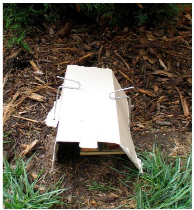
Figure 11. Cardboard covering used to limit nontarget captures when trapping voles.