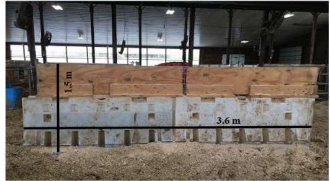
Figure 1. A blind made from plywood and a plastic road barrier filled with water was placed in the middle of the pen. Image provided by Creutzinger et al., 2021.

decreased attention from other cows, particularly in the 2 hours leading up to calving. These findings suggest that providing a blind structure allows cows to better isolate during calving, potentially reducing calving stress.