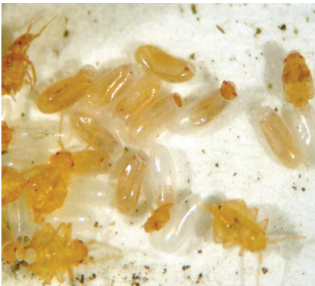
Bed bug eggs hatching