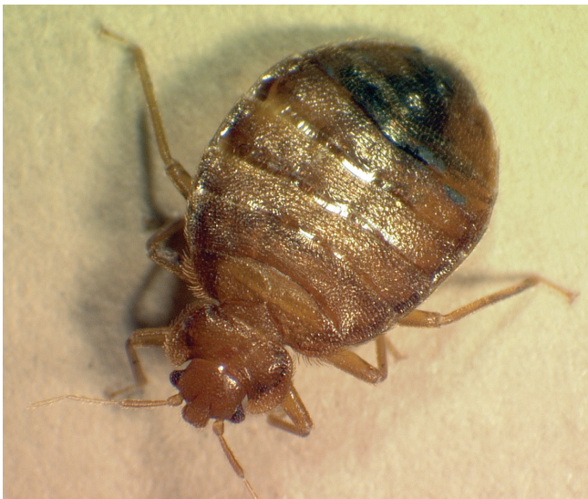
Unfed or starved adult bed bug

The most recent studies indicate that a well-fed adult bed bug held at room temperature ( >70^{\circ}\text{F} ), will live between 99 and 300 days in the laboratory. Unfortunately, we do not know exactly how long a bed bug might live in someone's home or apartment. No doubt it will be at least several months but conditions are usually more challenging for the bed bugs living in human dwellings than they are in the laboratory (it is hard to find food, there are fluctuations in temperature and humidity, insecticides may be present, it is easy to get crushed etc.) and these conditions will have a negative impact on bed bug survival.