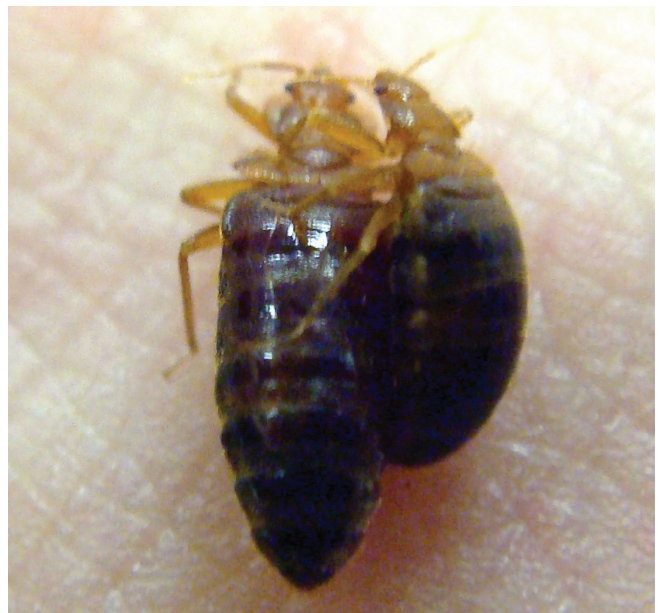
Bed bugs mating

In practical terms, this means that a single mated female brought into a home can cause an infestation without having a male present, as long as she has access to regular blood meals. The female will eventually run out of sperm, and will have to mate again to fertilize her eggs. However, she can easily mate with her own offspring after they become adults to continue the infestation.