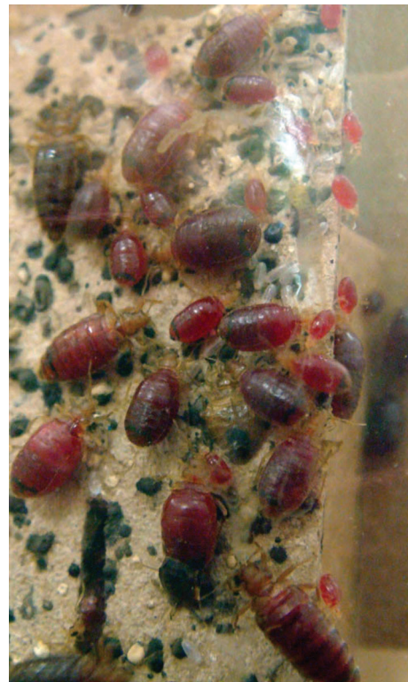
Fed bed bugs

The lifecycle data presented in this publication is based on research conducted using bed bugs collected from apartments within the state of Virginia. These populations have documented resistance to pyrethroid insecticides. Laboratory studies have indicated that resistant bed bugs have a shorter developmental time (several days), shorter life spans and lower levels of egg production than bed bugs that are not resistant to insecticides. At the time of this writing, practically all "natural" bed bug populations collected in Virginia have been found to be a least somewhat resistant to pyrethroid insecticides.