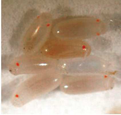
Bed bug eggs

The number of egg batches a female will produce in her lifetime is dependent on her access to regular blood meals. The more meals the female can take, the greater the number of eggs she will produce. For example, the average adult female will live about one year. If she is able to feed every week, she will produce many more eggs in that year than if she is only able to feed once a month.