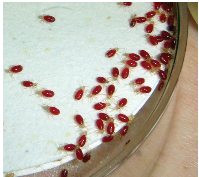
First instars after feeding

The time it takes any particular bed bug nymph to develop depends on the ambient temperature and the presence of a host. Under favorable conditions, such as a typical indoor room temperature (>70° F), most nymphs will develop to the next instar within 5 days of taking a blood meal. If the newly molted instar is able to take a blood meal within the first 24 hours of molting it will remain in that instar for 5-8 days before molting again. At lower temperatures (50° F - 60° F), a particular instar may take two or three days longer to molt to the next life stage than a nymph living at room temperature. However, if a bed bug nymph does not have access to a host, it will stay in that current instar until it is able to find a blood meal, or it dies. The time for a bed bug to develop from an egg, through all five nymphal instars, and into a reproductive adult is approximately 37 days.