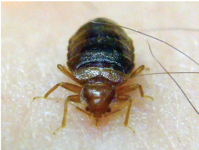
Bed bug feeding

when the human host is typically in their deepest sleep, that bed bugs like to feed.