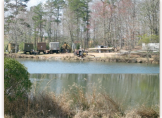
▲ Surface water ponds can be used for irrigation with precautions.

If surface water tests indicate high counts of generic E. coli , evaluate potential upstream sources of contamination. Using a filter or a small settling basin can sometimes help reduce coliforms. Be very cautious about how you use the water until you can correct the situation. Irrigation water can be treated using UV light, filters or ozonator units. Any chemicals used to treat water must be EPA registered and labeled for the intended use, just like pesticides are labeled for particular uses. As of December 2018, no chemical sanitizers are labeled for use to decrease fecal coliforms in irrigation water. This may change. An extensive list of sanitizers can be accessed by conducting an Internet search for Produce Safety Alliance Sanitizer List. Keep records of any treatments or corrective actions that you take to solve problems with your water.