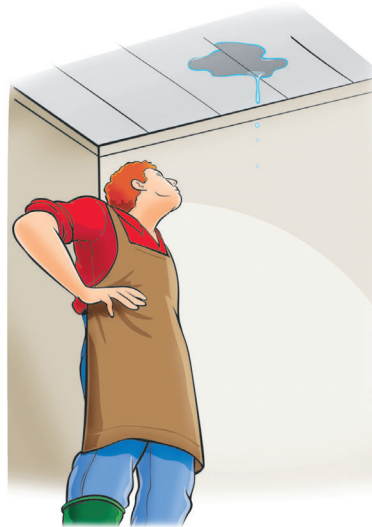
▲ Empower workers to report problems they see to their supervisor.