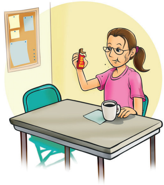
▲ Train workers to use designated break areas.