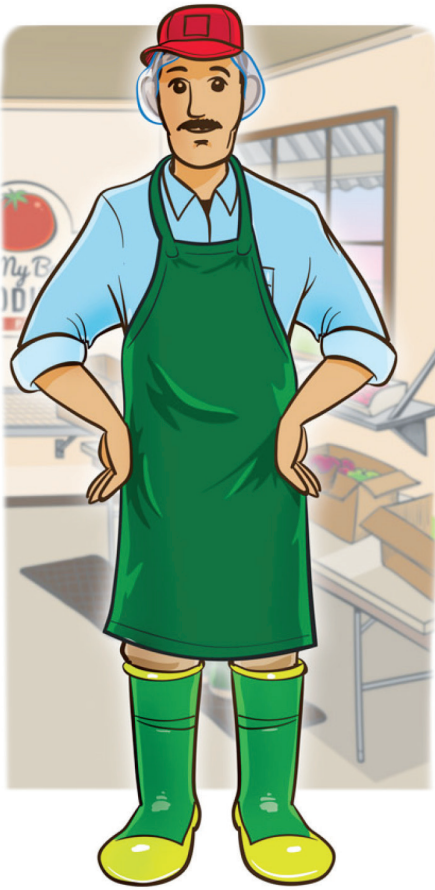
▲ Clean clothing, shoes and hair covers help to prevent contamination.