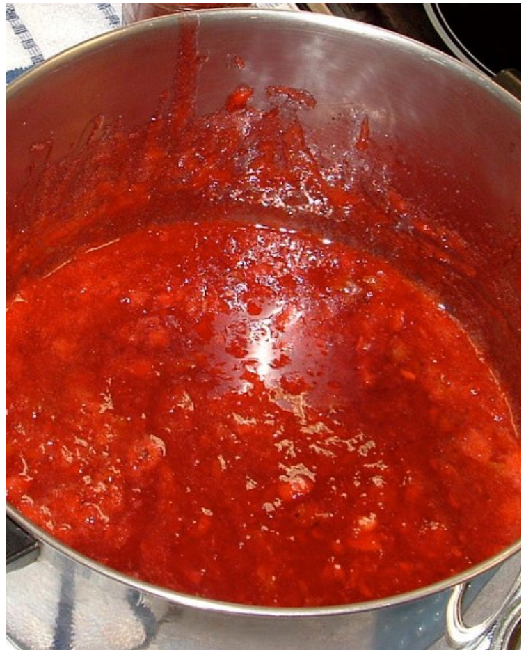
Figure 2. Strawberries that have been boiled to make strawberry jam.