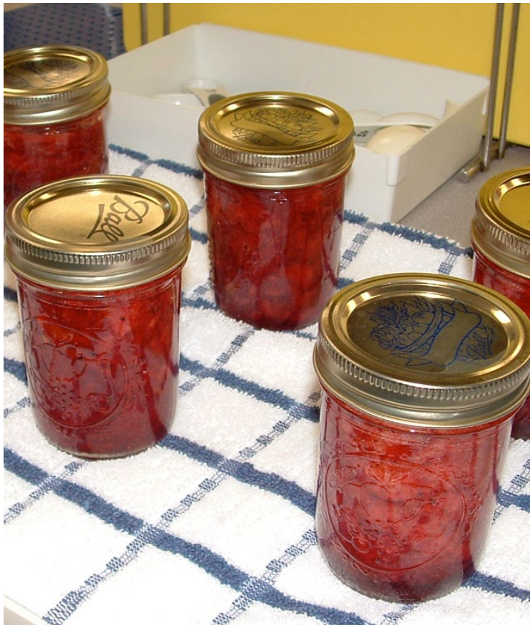
Figure 3. Jam produced and canned in canning jars with sealed lids that have been checked for a good seal.

Homemade jams, preserves, jellies and fruit butters should be sold and stored in canning jars with sealed lids, as shown in figure 3. As with all canned foods, store and sell your products in a cool and dry location. Heat (including storing in a sunny location or trunk of a car) can greatly affect the quality of canned products.