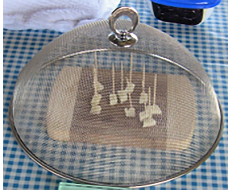
Figure 4. Samples covered and protected with a dome or plastic covering.