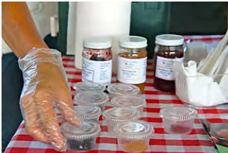
Figure 3. Samples served using closed single-use cups.