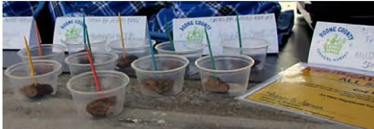
Figure 1. Samples served using single-use cups and toothpicks.