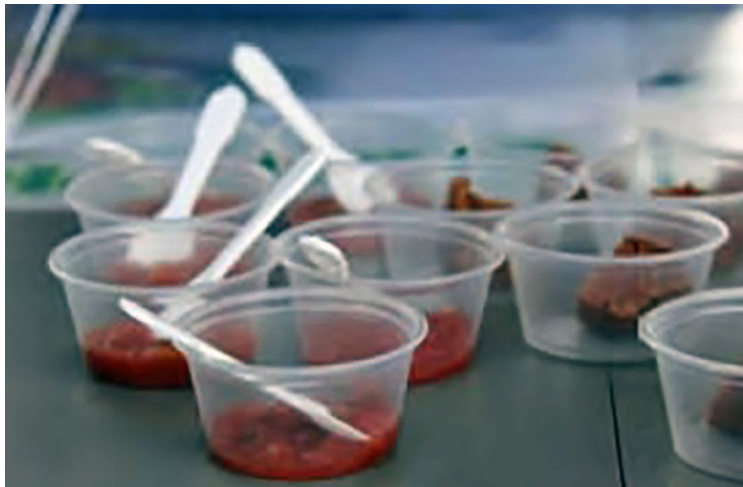
Figure 2. Samples served using single-use cups and single-use spoons.