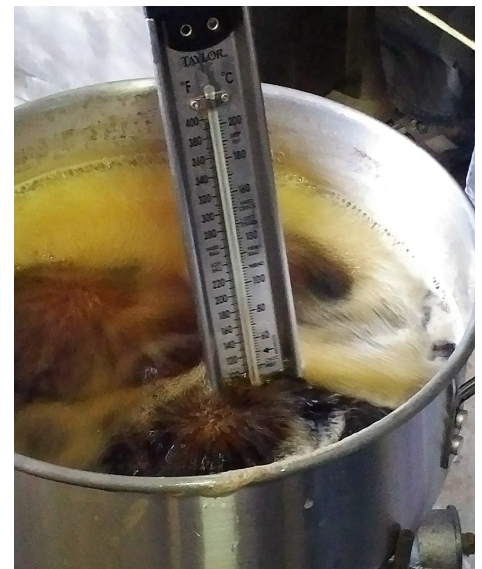
Figure 6. Using a candy thermometer to take the temperature of the syrup during cooking.