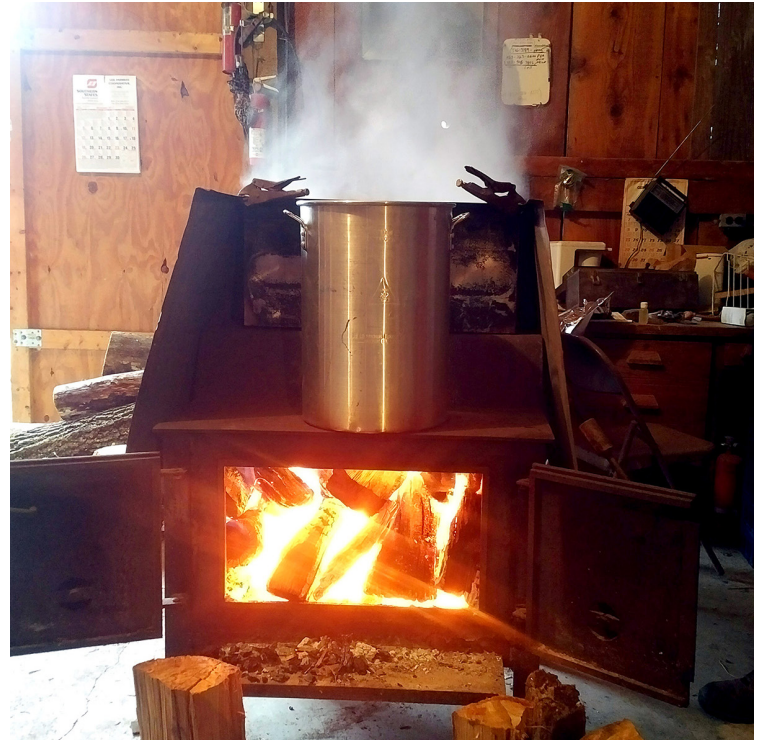
Figure 5. Boiling sap over an open fire to remove water and concentrate into syrup.