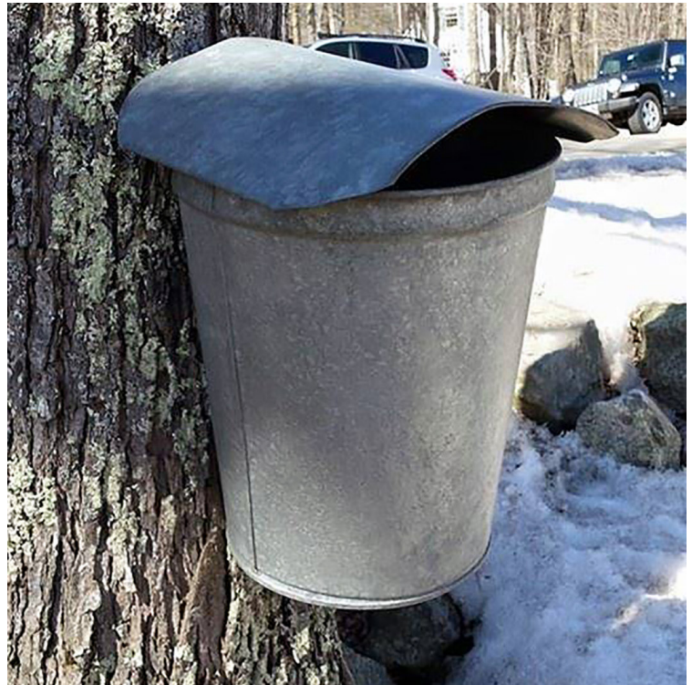
Figure 1. Covered bucket for maple sap collection.