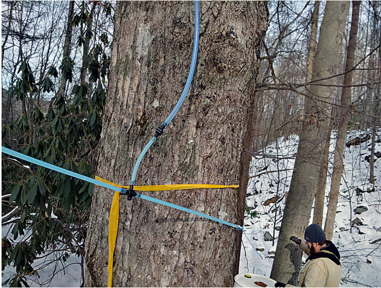
Figure 3. Plastic tubing connecting multiple trees collecting maple sap.