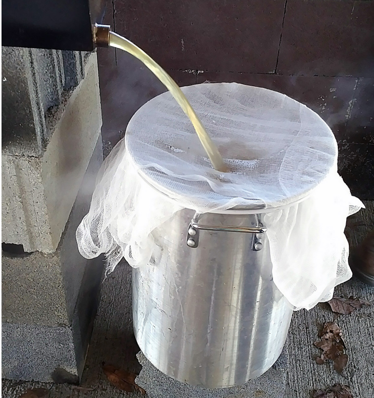
Figure 4. Filtering maple sap through cheesecloth to remove particulates. Use of cheesecloth is good for home use, but when processing syrup for sale, it should be filtered with an Orlon filter or filter press.