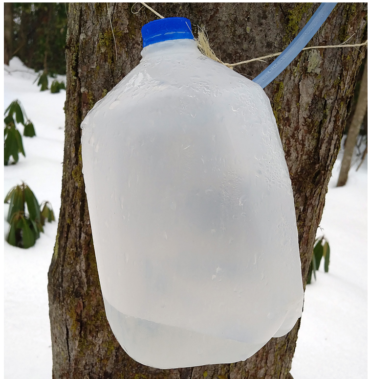
Figure 2. Plastic container with lid for maple sap collection.