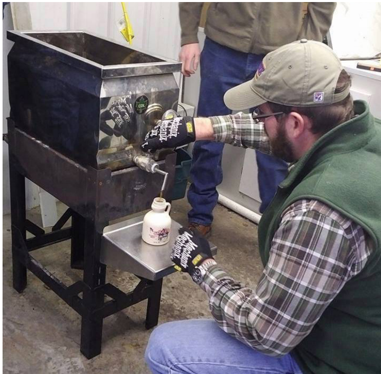
Figure 7. Bottling finished maple syrup for sale.