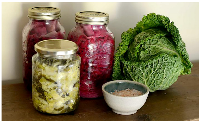
Figure 2. Photo of canned sauerkraut.

Of the many groups of fermenting bacteria, those from the lactic acid bacteria family (lactics) are the most important in vegetable fermentation — specifically Leuconostoc , Lactobacillus , and Pediococcus species (Hutkins 2019). These three groups of microorganisms are mainly responsible for producing the characteristic byproducts of fermented vegetables that include lactic and acetic acids, carbon dioxide, and ethanol (ethyl alcohol) from the natural vegetable sugars (Montville et. al 2012). The natural acids and other antimicrobial