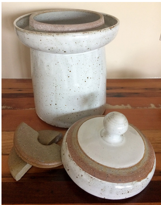
Figure 4. Example of a ceramic crock that can be used for fermentation and ceramic weights that can be used to keep vegetables fully submerged during fermentation.

The shape or style of crock does not affect product safety but could affect quality. Many crocks are simple cylinders with or without fitting lids. If a fitting lid does not accompany the crock, a plate or similar cover can be used. It is important to cover the product for both safety and quality. Other crocks have specialized rims with grooves or gutters in which a lid fits snugly within. The groove or gutter must be kept constantly filled with water to provide a seal that keeps oxygen out. These specialized crocks ferment better if the lids are not removed or disrupted, which might be difficult for curious cooks.