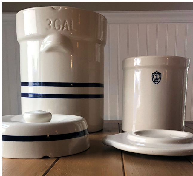
Figure 5. Example of 1- and 3-gallon ceramic crocks that can be used for fermentation.