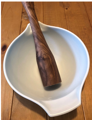
Figure 9. Example of a sauerkraut pounding tool. (Photo by Joell Eifert).

While vegetables can be allowed to rest after brining and before packing in order to allow water and juices to be naturally released from the vegetables, there are tools that can help extract the juice from vegetables more quickly. Crushers, pestles, and sauerkraut pounders crush the vegetable tissue so that the juices will be released more readily. When choosing any cooking tool, make sure that it can be easily cleaned. Cleaned and gloved hands can also be used to mix and squeeze brined vegetables to release water and juices. Shredding, chopping, and slicing will also help liberate vegetable juices.