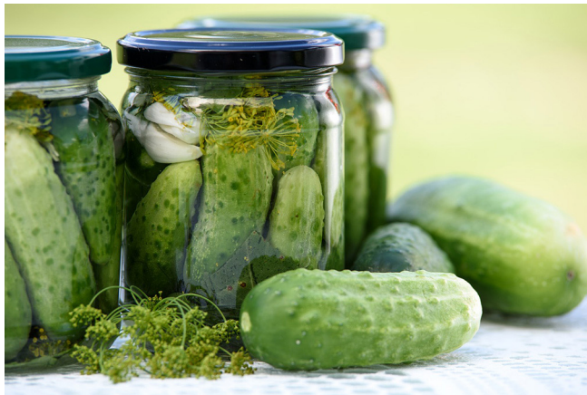
Figure 1. Photo of canned pickles.

People have been fermenting vegetables for centuries to increase the stability of fresh foods, make the foods safer to eat in the absence of refrigeration, and enhance their flavor (Hutkins 2019). Today, vegetable fermentation is done on a large-scale setting in factories as well as in households across the world. In the United States, the primary vegetables fermented are cucumbers (pickles; fig. 1) and cabbage (sauerkraut and kimchi; fig. 2). In many parts of the world, especially in developing countries where refrigeration is not common, fermented foods constitute a major portion of the diet.