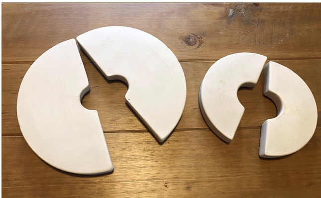
Figure 6. Examples of ceramic weights that can be used to keep vegetables submerged during fermentation.

Specific weights are available in various sizes for keeping vegetables submerged. If purchasing weights, choose a size that completely fills the inside of the container and covers the vegetables as completely as possible. Weights are available in ceramic and glass materials. Examples of ceramic weights are included in figure 6. Choose weights that can be cleaned and are food-grade. Do not use weights that are not intended for food use because they may contain harmful compounds such as lead. Rocks should never be used as weights because they may contain heavy metals and limestone that can degrade under salty and acidic environments and can become part of the food.