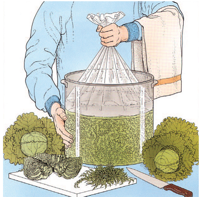
Figure 7. Weighting sauerkraut with a food-grade plastic bag and plate.

most of the vegetables. The plate can be weighted down with two to three sealed quart jars filled with drinkable water or heavy-duty plastic food bags filled with a brine solution. It is recommended that the brine solution be stored in plastic bags to ensure that the fermentation brine is not diluted should the bag leak or break. The brine can be made by mixing 4 1/2 tablespoons of salt for every 3 quarts of drinkable water. Covering the fermentation container opening with a clean, heavy bath towel or lid helps prevent contamination from insects and molds while the vegetables are fermenting.