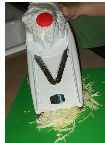
Figure 8. Mandolin. User is wearing a cut-resistant glove.

Evenly chopped or shredded vegetables will ferment more efficiently. Chopping and cutting will help release juices from the vegetables and allow the vegetables to become more evenly brined. Knives, mandolins, and kraut boards can be used to cut vegetables. Ensure that all cutting devices can be easily cleaned and are not made of materials that harbor microorganisms. Kraut boards and mandolins