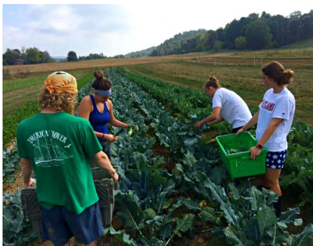
Students harvesting broccoli at Virginia Tech’s Dining Services acreage at Kentland farm.

Through a research study conducted through Harvard’s Food Law and Policy Clinic, the contributors highlight the importance of how universities and colleges should be capitalizing on the increasing demand of buying and eating local. They recommend that state colleges and universities gain a “competitive edge” by being more transparent with their food procurement practices. This in turn could raise the colleges’ and universities’ public ranking and would therefore give themselves a competitive edge in student recruitment. Collaborations, in which institutions grow a part of their produce at campus facilities, not only provide a fresh source of local foods for the dining hall, but also