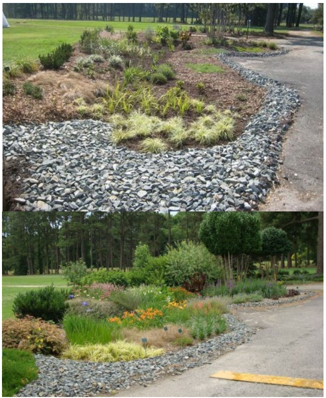
Figure 3. Top, newly planted rain garden; bottom, after three years.

Space the plants according to their mature size. Groundcovers and perennials should be spaced so their canopies will grow together and cover the ground quickly to minimize weeds and mulching. Shrubs should be planted so their mature canopies will touch but not grow together and compete. For example, inkberry shrubs that grow 4 feet wide should be planted 4 feet apart on center (see figure 3).