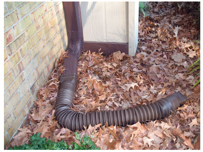
Figure 2. Example of a downspout with a flexible extension pipe. Direct the runoff 10 feet away from the foundation and into the landscape.

Rain gardens can be located anywhere along the natural runoff pathway. If the garden can't be located along the natural water pathway, runoff can also be directed into a rain garden (through pipes or swales) (see fig. 2). Rain gardens can be in sun or shade and should be located at least 10 feet away from building foundations, not on steep slopes, not over underground utilities or a septic field, not where soil clay content is high, and not where the water table is high. The bottom of the rain garden should be at least 2 feet above the seasonal high water table level to promote infiltration.