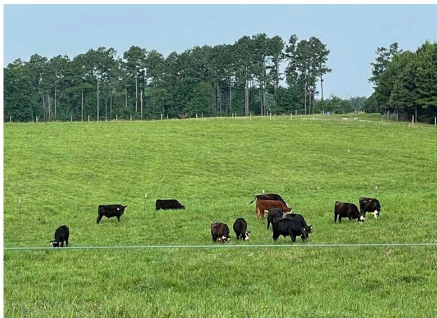
Figure 8. Steers grazing novel tall fescue in May 2022.

While the stocking methods employed in the first two years allowed for a reasonable comparison of average daily gains across two types of pastures, the true carrying capacity or animal grazing days produced on an area basis could not be determined with this arrangement. Thus, in the third year of the project, 32 steers were managed in a single herd, all of the four-acre paddocks were split in half, and the larger herd was stocked on these paddocks for 3-4 days or until an insufficient forage threshold was reached. Steers were removed from NWSG pastures between July 3 and July 20, 2023 to allow for adequate pasture regrowth.