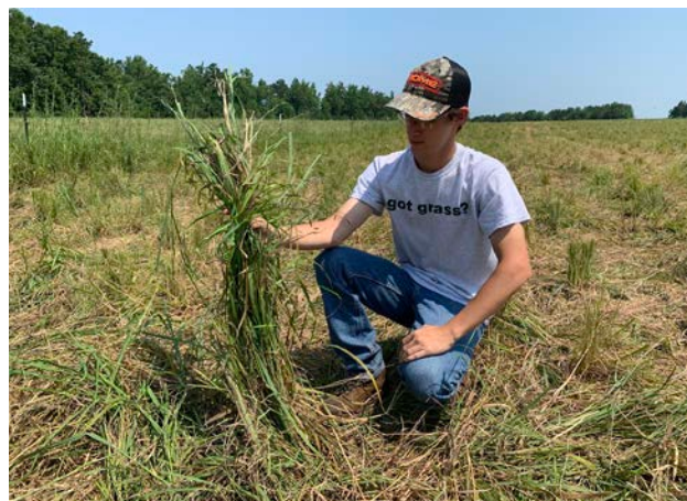
Figure 10. Delayed grazing resulted in trampling and underutilization of native warm season grasses in 2021.

underutilized and the steers trampled a substantial portion of the NWSG.