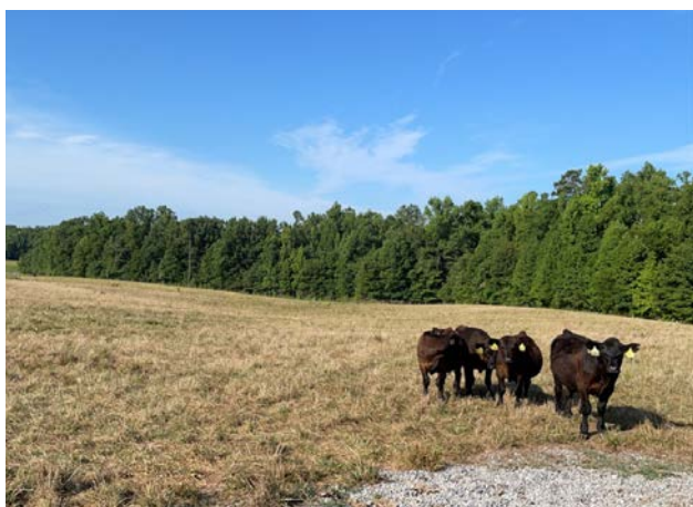
Figure 9. Steers on novel tall fescue in August 2022 during drought conditions in Blackstone, Virginia.