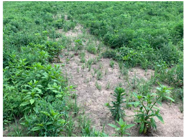
Figure 4. Native warm season grass seedlings were evident in early summer of the establishment year, but there was also substantial broadleaf weed germination and cover.

While the weedy grasses were effectively controlled by the Plateau herbicide application, a substantial amount of marestalk ( Erigeron canadensis ) germinated and eventually outgrew the young NWSG seedlings.