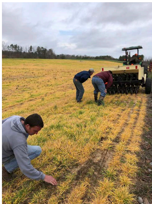
Figure 2. Checking seed flow and planting depth while cross-planting the NWSG mixture in March 2020 in Blackstone, VA.

In mid-August, 2019, the field was sprayed again with glyphosate (2 qt/ac) and Remedy (1 qt/ac). Barley ( Hordeum vulgare , 60 lb/ac) was seeded into the field on October 15 as a cover crop. The barley was terminated with glyphosate (0.5 qt/ac) on February 24, 2020, with the NWSG seed mixture planted on March 17, 2020.