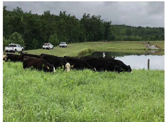
Figure 1. Cattle grazing a productive pasture of native warm season grasses during the middle of summer.

because their roots can exploit water resources at greater depths than cool-season grasses. Their deep rooting potential also has value for carbon sequestration.