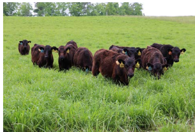
Figure 7. Steers grazing native warm season grasses in May 2022.

In 2022, steers were sourced from the same farm and the pastures were managed similarly to year one. The project also began about one month earlier in year two. Sixteen steers were stocked on each pasture on May 11. The steers were stocked on each paddock three times for about seven days per paddock. However, due to a drought, the steers were pulled from these treatment pastures one week early, at which point the study was concluded for the year.