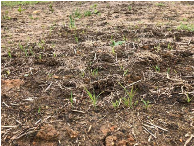
Figure 3. Native warm season grass seedlings germinating in May 2020.

Ten days following planting, Plateau herbicide (4 oz/ac) was sprayed over the field to control summer annual grassy weeds. The three NWSG species planted into the field are tolerant of this particular herbicide, but other native grasses, including switchgrass ( Panicum virgatum ) and Eastern gamagrass ( Tripsacum dactyloides ) are not tolerant of the active ingredient in this herbicide, imazapic. This herbicide provides effective pre-germination control of many summer annual grassy weeds, which are a substantial threat to the successful establishment of NWSG, for a couple months following application, depending on the weather.