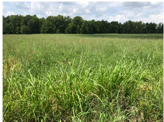
Figure 5. The native warm season grass stand by the end of the establishment growing season in August 2020.

Once these young grass seedlings had grown to the point of tillering in early July, an herbicide application of Duracor (12 oz/ac) and Cimmaron Plus (0.125 oz/ac) was sprayed on the field. This largely eliminated the broadleaf weed competition within a few weeks.