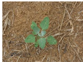
(b) Common lambsquarters