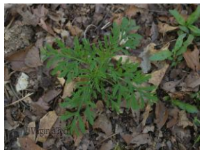
(a) Common ragweed

The Accomack and Northampton counties in the Eastern Shore of Virginia produce about 80% of Virginia's total potato crop (Northampton County, 2023). Keeping the weeds under check is one of most important prerequisites in achieving satisfactory potato yields. Weed infestation and herbicide resistance are continuously haunting the growers owing to the lesser number of viable herbicide options than before. The menace of weeds in the upcoming season depends to a larger extent on the practices being followed over the previous years and can be prevented by certain practices planned well in advance.