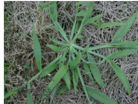
(d) Large crabgrass