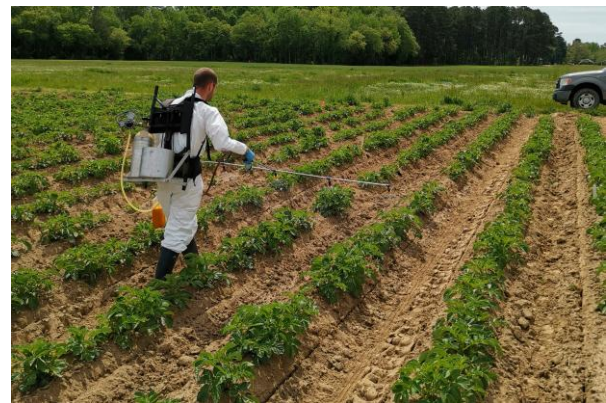
Figure 2. Application of herbicides before row closure

The success of a weed control program is based on the regular and timely identification of prevalent weeds in the field, growth stage of weeds and the crop. In the Eastern shore of Virginia, major weed issues in potato are common ragweed, common lambsquarters, Palmer amaranth, large crabgrass, and yellow nutsedge (Figure 1).