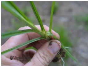
(e) Yellow nutsedge