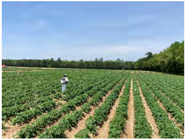
Figure 1. Training the new plant pathology technician (Calyn Adams) to apply foliar fungicides treatments to research plots.