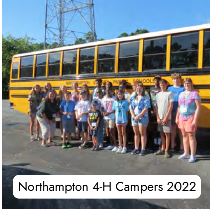
Northampton 4-H Campers 2022

Northampton 4-H is preparing for SAGEN (Suffolk, Accomack, Greensville, Emporia, Northampton) summer camp July 17-21 in Wakefield, VA.