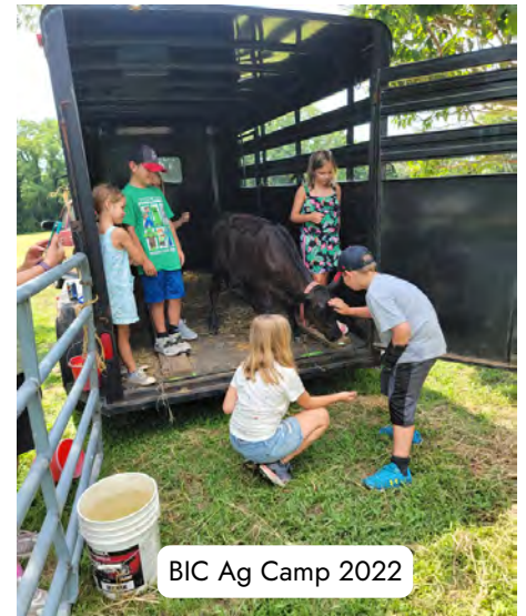
BIC Ag Camp 2022

Register at BIC website: https://barrierislandscenter.org/programs